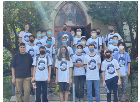
University of Rochester Wilson Day volunteers

This summer has been filled to the brim with volunteer groups looking to help out and make a difference here at SMSJ! In the past few months, we have hosted groups from University of Rochester, Excellus Blue Cross Blue Shield, Rochester Institute of Technology, and several United Churches of Christ in Buffalo in the E.D.E.N. Gardens. Projects completed include moving raised beds at the Denver Training Garden, moving beds, mulching, and constructing a new fence at the Children's Garden, building five new raised beds at Culver 1199, and unearthing leaky irrigation systems. Thank you so much to these volunteer groups and to our SMSJ volunteers who helped run these volunteer days!