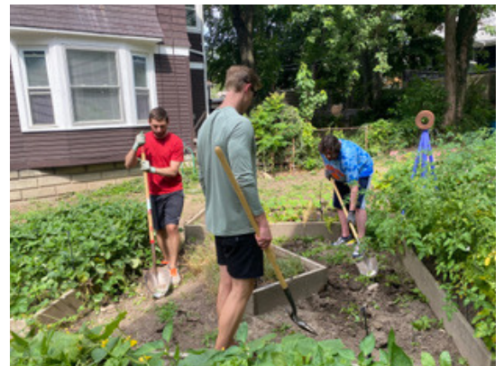
Excellus BCBS volunteers moving raised beds at the Children's Garden