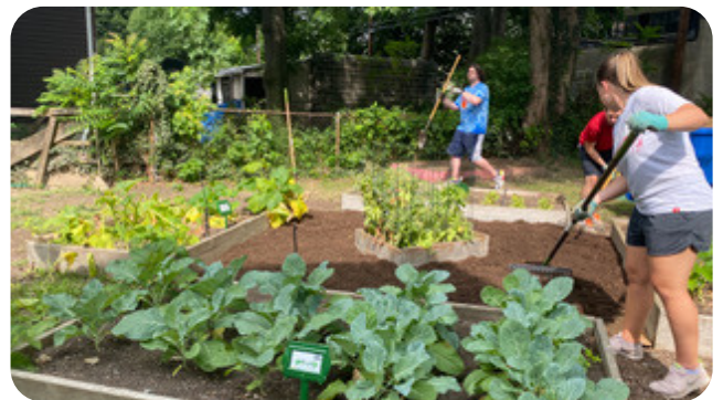
Volunteers from Excellus BCBS mulching at the Children's Garden